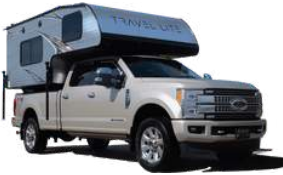
Truck Camper

The decision between motorized or towable has to do with your preferences. A larger family with children may benefit from being able to use the living space while en route. If you already have a truck or SUV you may save money with a towable and have the benefit of having a vehicle to drive around while at your destination.