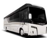
Class A

Within the motorized options , there are many subtypes. Class A refers to the large motorcoaches, which may require a Class A driver's license. Class B is the smallest, usually a converted van, they'll drive easier but may be too small for extended periods. Class C are those built on a truck chassis, known for their over the cab box which usually houses a sleeping quarter.