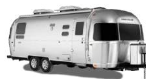
Travel Trailer

As for the towables there are two subtypes, the fifth wheels and the bumper pull trailers or travel trailers as most commonly known. Fifth wheels tend to be larger and more expensive, they must be towed with a truck where the truck bed is surrendered to the hitch (i.e. you won't be able to use the truck bed for storage).