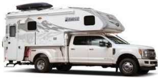
Truck Camper

The decision between motorized or towable has to do with your preferences. A larger family with children may benefit from being able to use the living space while en route. If you already have a truck or SUV you may save money with a towable and have the benefit of having a vehicle to drive around while at your destination.