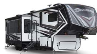
5th Wheel

Travel trailers come in a variety of sizes, with the smaller ones able to be towed by just an SUV using a traditional ball hitch . The preference for one or the other tends to be determined by the level of comfort in towing, where fifth wheels seem to be the winners as they have no sway. (Keep in mind that fifth wheels are taller than travel trailers, so clearance issues must also be taken into account.) However, many advances in travel trailer towing technology have made sway less of an issue. For the ultimate travel trailer hitch, I recommend ProPride hitch . The less expensive next best is this one from Equalizer .